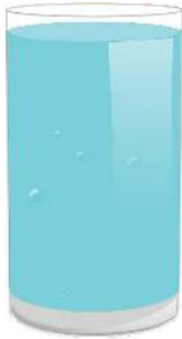
Water in a glass