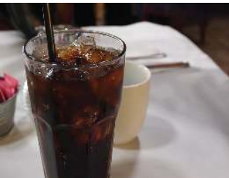
Cup of cola