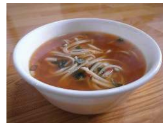
Bowl of soup